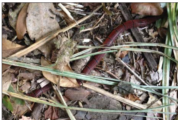
Fig. 4 Sinomicrurus maccllelandi (not vouchered) in Bokor National Park, Kampot Province, southern Cambodia.