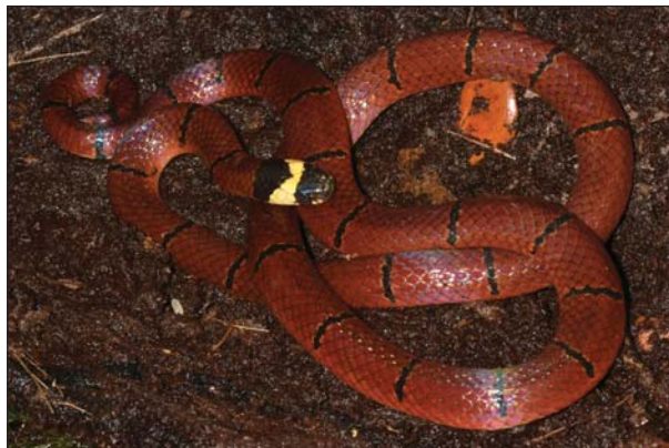
Fig. 3 Sinomicrurus maccllelandi (CBC 02885) in Bokor National Park, Kampot Province, southern Cambodia.