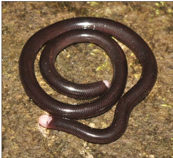
Fig. 5 Indotyphlops albiceps (CBC 02861) in Bokor National Park, Kampot Province, southern Cambodia.

yellowish-cream transverse band behind eye; indistinct scattered yellowish cream spotting anterior to eye, on internasals, and prefrontals; and ventral surface cream with black blotches. Photographs taken in February 2016 reveal a snake with a slim, cylindrical, red body, with regular transverse thin black bands, and a black head with a large cream band. Although the snake is partially obscured in the photographs, these characteristics are sufficient to confidently assign the individual to this species (Taylor, 1965).