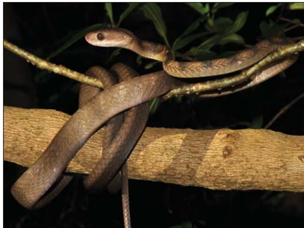
Fig. 2 Boiga guangxiensis (CBC 02791) in Keo Seima Wildlife Sanctuary, Mondulkiri Province, eastern Cambodia.