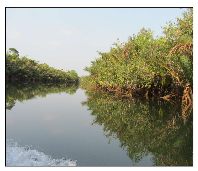
Fig. 2 Sre Ambel River.

continuity. The Fisheries Administration (part of the Royal Government of Cambodia's Ministry of Agriculture, Forestry and Fisheries) has been working with the Wildlife Conservation Society (WCS) and the U.S. Forest Service (USFS) to establish a community fishery with the